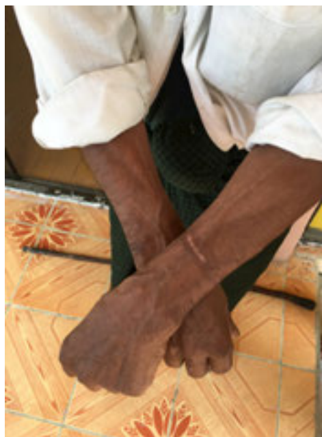
A 67-year-old ethnic Rakhine man shows a scar from when Myanmar soldiers bound his wrists with rope and tied him to a wooden pole for hours, 30 March 2019.

An 80-year-old retired Rohingya teacher from Kyar Gaung Taung village in Maungdaw Township, Rakhine State, similarly described being detained and beaten by Myanmar soldiers, during an incident in 2017 that preceded the military burning the village and forcing everyone, including the teacher, to flee to Bangladesh. “Seven or eight days before they set fire to the village... soldiers came to my home, they didn’t even ask me any questions, they just started beating me—with a stick,” he recalled. “When the soldiers came, I was the