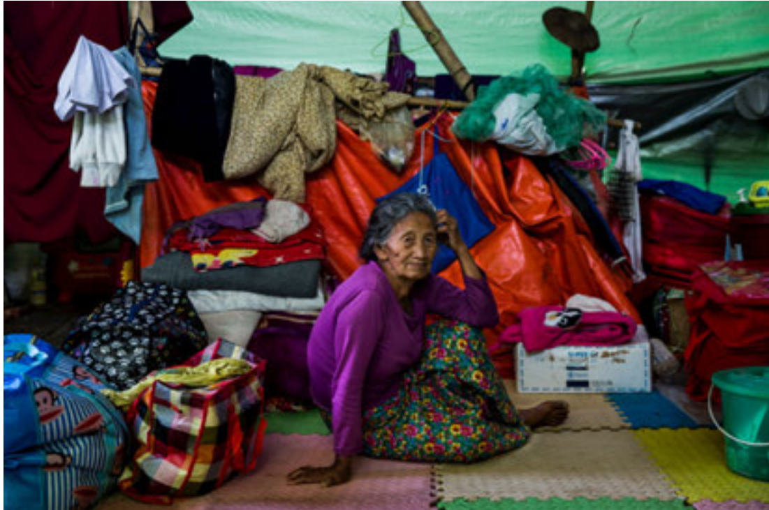
An older ethnic Kachin woman sits in her shelter in Jaw Masat IDP Camp, Myitkyina Township, Kachin State, 10 December 2018