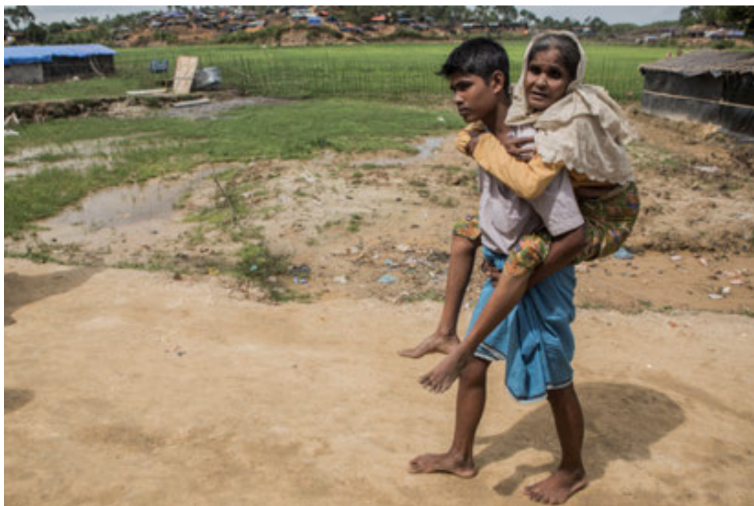
A boy carries an older Rohingya woman in the refugee camps in Bangladesh, 28 September 2017.

He had not heard news of his grandfather in the 18 months since, but assumed he died there on the path. “Sometimes my relatives here, they ask me, ‘How could you leave behind your grandfather?’” the grandson recalled, tearfully. He said he had seen around ten other older people who were left behind along the path, huddled in blankets similar to what was used to transport his grandfather. 88