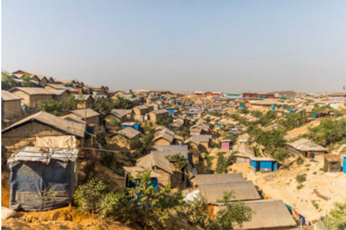
Shelters are packed together in the refugee camps, up and down hills. The terrain is difficult for some older people, particularly those with reduced mobility, which brings challenges for accessing latrines, distribution sites, and health facilities, Bangladesh, 20 February 2019.