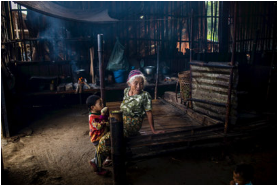
An older ethnic Kachin woman and her grandchild pass the time in a common cooking facility for IDPs at the Kutkai Downtown (KBC Church) IDP Camp in Kutkai, northern Shan State, Myanmar, 28 July 2017.

Neither the creation of a new sub-committee or group on older people’s rights, nor the systematic inclusion of one or more older people on a camp committee, will, on its own, address the issues outlined in this chapter or in the preceding chapter on the Bangladesh refugee camps. But it will better ensure that camp-in-charge officials like the one from Myitkyina Township cited above hear older people’s voices and their ideas for responding to their specific needs. It will also, as importantly, see and treat older people as resources and essential participants in the decisions being made for everyone living in the camps.