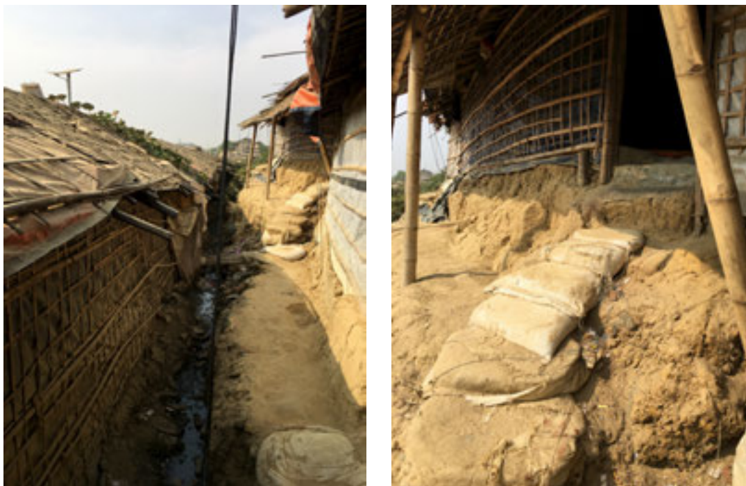
The path leading to the shelter of the 90-year-old man in Camp #11, Bangladesh, 16 February 2019

The man, who had been a farmer in Myanmar, said he tries to walk to the latrine when possible, but “if I can't make it there, I go inside the house... I have no choice.” 199 He said he pays someone to come a few times a week to throw out the waste and clean the pan he uses inside the shelter, giving the person 1,000 taka (US$12) every two months—stretching his and his wife's already limited resources. 200