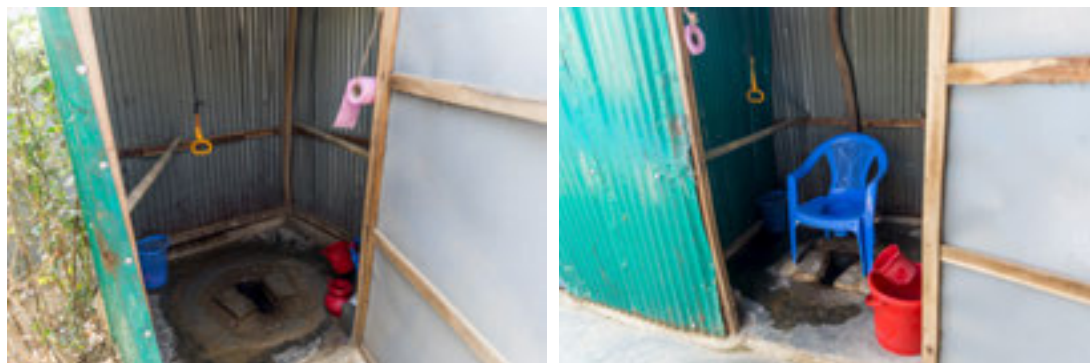
Latrines with a rope handle and plastic latrine chair, Camp #18 Age Friendly Space, Bangladesh, 23 February 2019