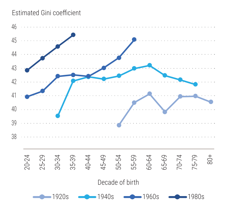
Figure 2b Gini coefficient by age and birth cohort, selected developed countries