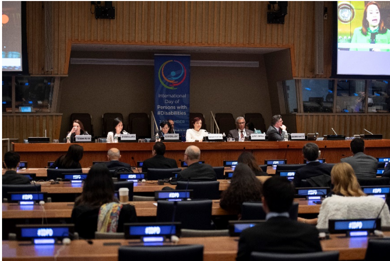
Photo 1: A photo of the International Day of Persons with Disabilities, 20 December 2018

on “Accessible Cities for All: Smart and Inclusive Urban Planning” as key elements to reduce inequalities and empower people to live in accessible, usable and friendly healthy environments. For more information, please visit: https://www.un.org/development/desa/disabilities/international-day-of-persons-with-disabilities-3-december/idpd18.htm