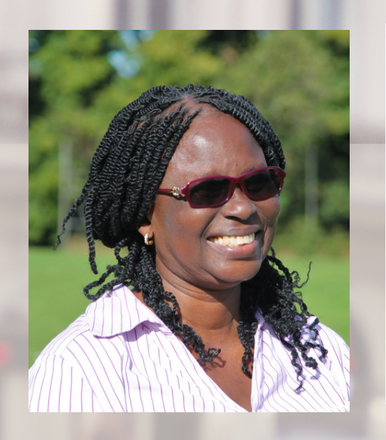
Gertrude Oforiwa Fefoame Member of the United Nations Committee on the Rights of Persons with Disabilitiess