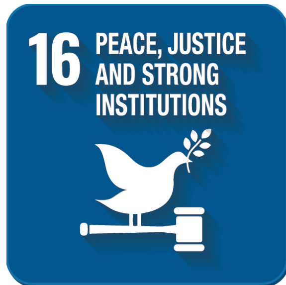
Logo of the Sustainable Development Goals (SDGs) 16 of the United Nations Organization.

A quality inclusive police service for persons with disabilities will require the development, implementation and evaluation of a set of minimum standards and guidelines, including the provision of procedures and reasonable accommodation.