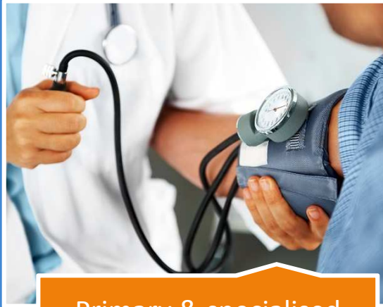
Primary & specialised care