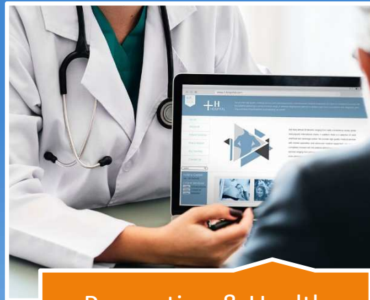
Prevention & Health literacy