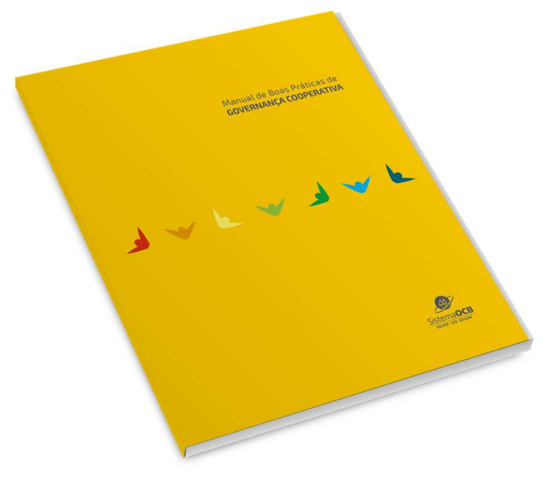
Handbook of Cooperative Governance