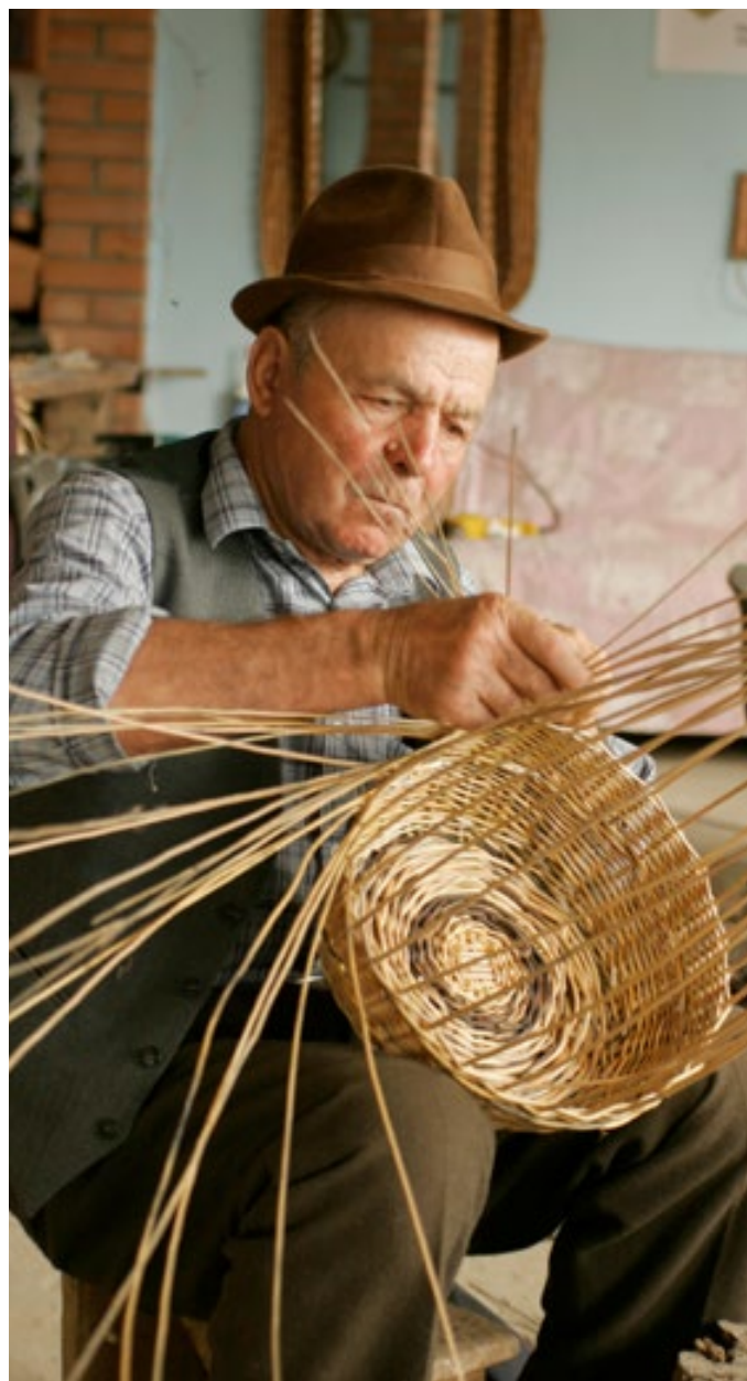
HelpAge International Moldova