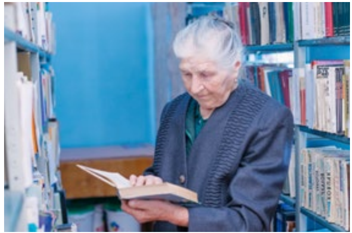
HelpAge International Moldova