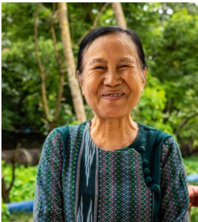
Ben Small/HelpAge International