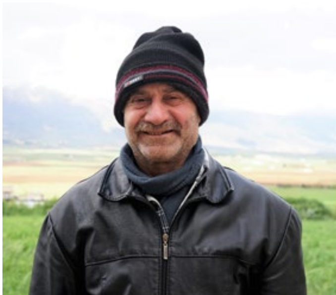
Fedaa Qatashshah/HelpAge International

At the regional level, older people's right to access to justice is enshrined in Article 31 of the Inter-American Convention on Protecting the Human Rights of Older Persons and Article 4 of the Protocol to the African Charter on Human and Peoples' Rights on the Rights of Older Persons in Africa.